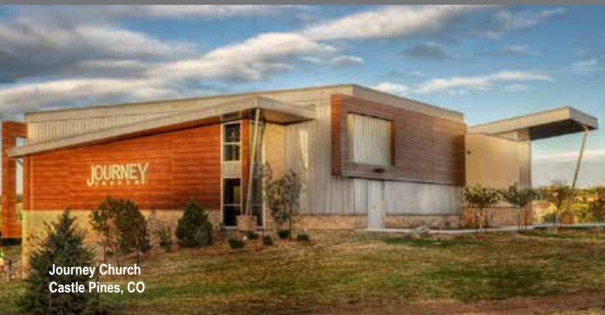
Journey Church Castle Pines, CO

Building Solutions in Colorado since 1955 himmelmanconstruction.com