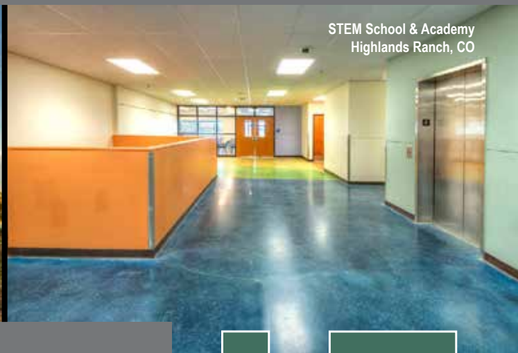
STEM School & Academy Highlands Ranch, CO

Proud Sponsor of the 2018 ASAC Excellence in Safety Awards 2017 & 2016 Excellence in Safety Winner / Category of up to 50,000 Man Hours