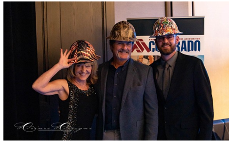
Excellence in Safety Award Diamond Excavating, Inc.