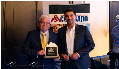
The Roofing Company Subcontractor of the Year | Under 10 million