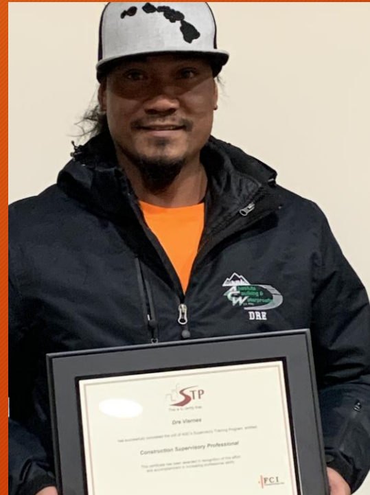
Dre Viernes Absolute Caulking & Waterproofing